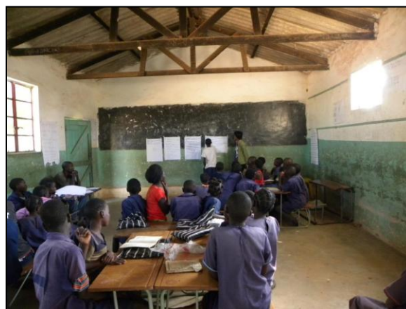
session in Chiyobola Basic School

A total number of 448 adults participated to 6 meetings.