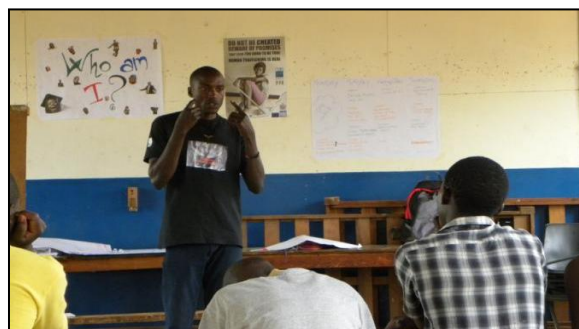
session during the Orphans' camp